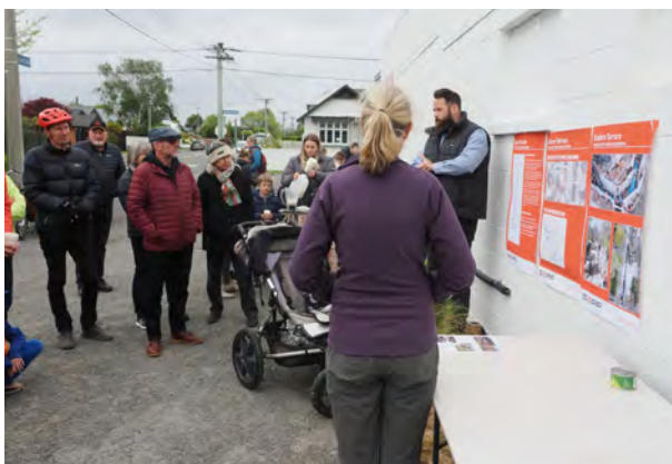
Pipe project update at BNA Biketober event, 24/10/22

Newsletter of the Beckenham Neighbourhood Association Issue 144, December 2022 electronic only