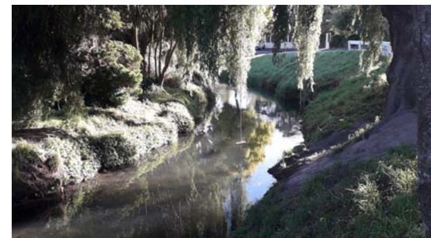
River swing on Waimea Terrace

Newsletter of the Beckenham Neighbourhood Association Issue 142, March 2022